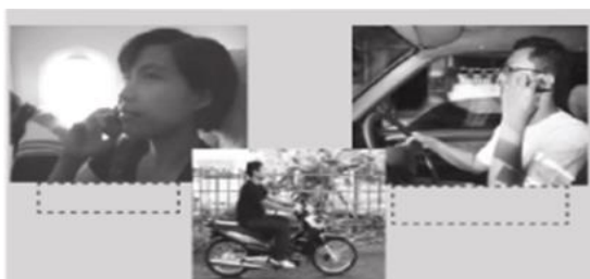
Figure 2. A18 Data

Pro-social behavior also could be identified in reading text, dialogue, and task. They were coded as A14, A16, A18, and A19. The data was represented by A18. In pairs, study the pictures below and discuss what people have done wrong in each picture.