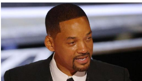
Figure 3: Will Smith has apologized

After he slapped him at the Oscars, saying his behavior was "unacceptable and inexcusable". "I would like to publicly apologize to you, Chris," he said in a statement. "I was out of line and I was wrong." It comes after the Oscars film academy condemned Smith over the incident and announced a formal review.