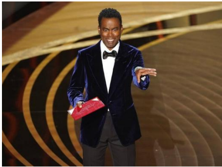
Figure 1: Chris Rock went on stage

The incident that shocked the public began when Chris Rock went on stage to read out the Best Documentary Features nominations. The comedian also made jokes about Javier Bardem and his wife, Penelope Cruz, who were nominated for an Oscar. Then he began to discuss Jada Pinkett Smith's appearance with bald hair which is similar to the film GI Jane . He said: "Jada, I love you. GI Jane 2 , can't wait to see you," as Jada can be seen rolling her eyes at the joke. The GI Jane joke makes reference to a 1997 action movie which stars Demi Moore as Jordan O'Neil, who shaves her head to become GI Jane to solidify her position as a Navy Seal.