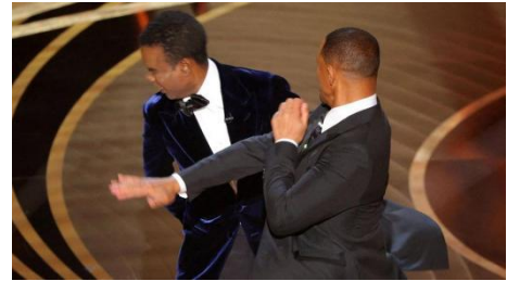
Figure 2: Will Smith slapped Chris Rock

The incident that shocked the public began when Chris Rock went on stage to read out the Best Documentary Features nominations. The comedian also made jokes about Javier Bardem and his wife, Penelope Cruz, who were nominated for an Oscar. Then he began to discuss Jada Pinkett Smith's appearance with bald hair which is similar to the film GI Jane . He said: "Jada, I love you. GI Jane 2 , can't wait to see you," as Jada can be seen rolling her eyes at the joke. The GI Jane joke makes reference to a 1997 action movie which stars Demi Moore as Jordan O'Neil, who shaves her head to become GI Jane to solidify her position as a Navy Seal.