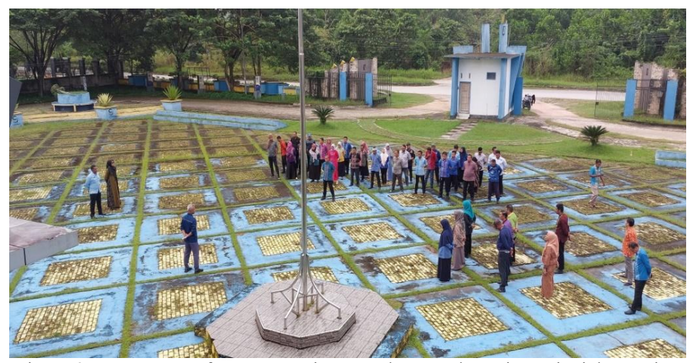
Figure 2 Department of Transportation, Southeast Sulawesi Provincial Morning Assembly: Instilling a Culture of Discipline for Mutual Success (2025)

with fingerprints and absence based on the Simponi ASN application (Tawakal, 2023). This is because ASN realizes that this type of absence is part of the discipline of following the rules set within the scope of the Department of Transportation, Southeast Sulawesi Provincial as well as the ongoing socialization carried out starting from the BKD level of Southeast Sulawesi Provincial level and by the Department of Transportation, Southeast Sulawesi Provincial itself (through the General and Personnel Sub-Division).